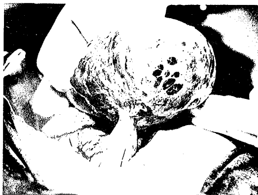
Fig - 2 : Intraoperative view showing the connection of the tumor with the greater gastric curvature.

lowing transfusion of 2 units of packed red cells. At surgery, about 4 liters of ascites were aspirated. An unencapsulated, fragile dark red mass protruded from the abdominal cavity. It was attached by a thin pedicle to the greater curvature near the antrum (Fig 2). The mass was removed with a 4-5 cm. wedge of the stomach. A liver biopsy was performed. Other abdominal structures were normal.