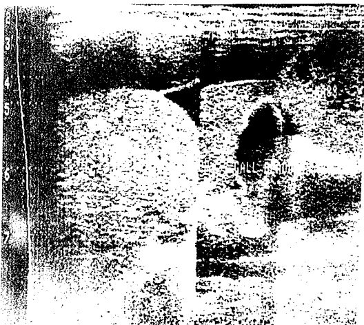
Fig - 1B