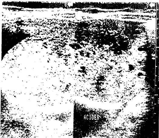
Fig - 1A

An exploratory laparotomy was carried out fol-