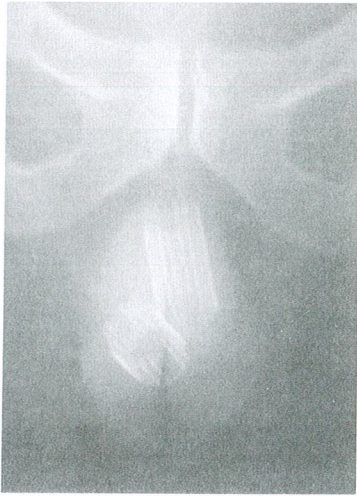
Fig. 1: Two urethral stents in the pelvic radiograph.