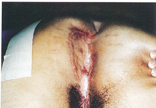
Fig - 1 : In spite of the early surgical intervention of split-thickness skin grafting, complete anal stenosis developed secondary to the extensive inflammation of previous Fournier's gangrene.

A 23-year-old male was admitted for complete cicatricial anal stenosis. Three months before admission, he had undergone wide surgical debridement plus laparoscopic sigmoid loop (functional end) colostomy at our department for Fournier's gangrene, following outpatient hemorrhoidectomy in another clinic. The postoperative course was uneventful, and three weeks after this initial procedure, the large perineal defect was covered by split-thickness skin graft. In spite of this early reconstructive intervention, we were faced with complete anal stenosis two months later (Fig. 1).