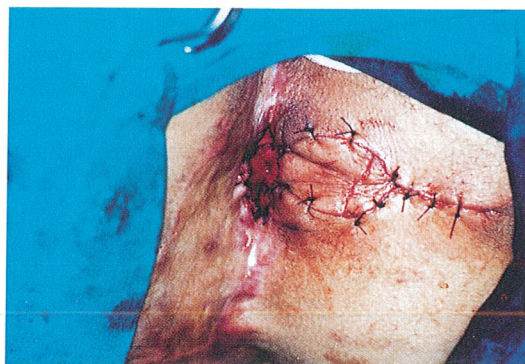
Fig - 3 : The resultant anal opening was tightly patent and lacked any raw surface.

edge was connected with absorbable sutures, and the rest of the freed mucosal edges were marsupialized circumferentially to create the new, fully-epithelialized, and partially everted anal opening (Fig. 3). The resultant anal opening lacked any raw surface and it was wide enough to allow passage of a lubricated index finger.