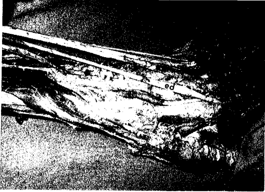
Fig - 1 : The extensor indicis muscle in our cadaver showing variation of its origin.

ed : Tendon of extensor digitorum going to the index finger. ei : Extensor indicis muscle.