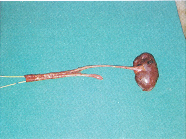
Figure 2: Gross appearance of the duplicated ureter one of them has blind end.

is the primordial portion of the permanent kidney 1 . When a premature division of the ureteric bud occurs, and if one of the limbs fails to reach the metanephric tissues then a blind-ending branch will be formed 6 .