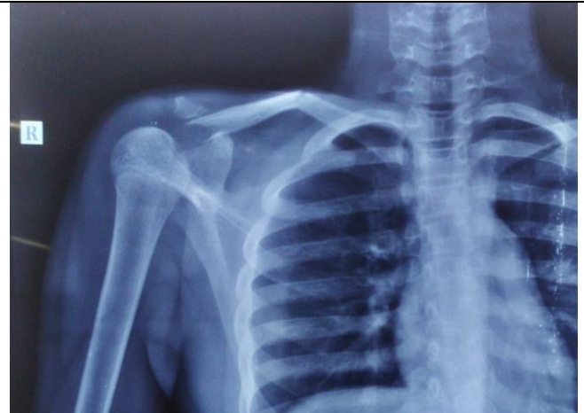
Figure 2: Post-injury radiograph showing segmental right clavicle fracture.

The treatment plan was explained to the parents of the patient, and their informed consent was taken. The plan was a surgical fixation of lateral physeal injury given gross displacement and conservative management of midshaft fracture because of minimal displacement. She was treated surgically by open reduction and k wire fixation of lateral physeal fracture under general anaesthesia (Figure 3, Figure 4). The torn periosteal sleeve was repaired around the lateral end of the clavicle. She was given arm pouch immobilization for four weeks, followed by shoulder and elbow joints' active mobilization.