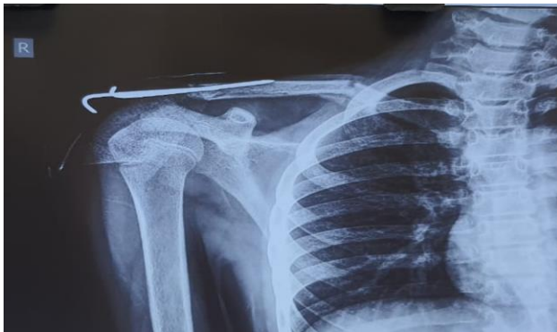
Figure 5: Radiographs at six weeks of follow-up showing fracture consolidation and maintenance of good alignment of the right clavicle.

Follow-up radiographs at six weeks revealed the fractures' consolidation, and hence k wires were removed (Figure 5). There were no complications. At the end of eight weeks, the patient had complete range of motion at shoulder and elbow joints and was able to return to preinjury activity levels (Figure 6).