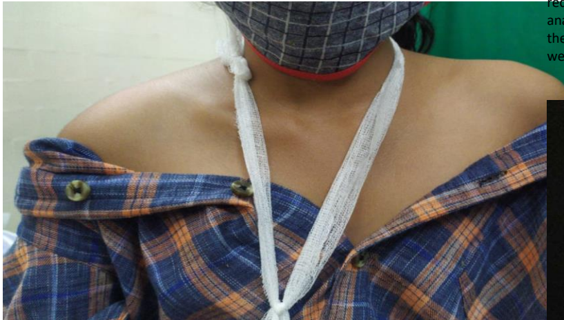
Figure 1: Clinical picture following injury showing swelling along the right clavicular region.

A 12-year-old girl presented with pain and swelling over right clavicle following fall on outstretched hand (Figure 1). There was diffuse tenderness over the whole extent of the clavicle with painful restriction of shoulder movements. There were no distal neurovascular deficits. Radiographs revealed minimally displaced fracture at midshaft and significantly displaced fracture at lateral physis region (Figure 2). She was initially treated by arm sling and analgesics.