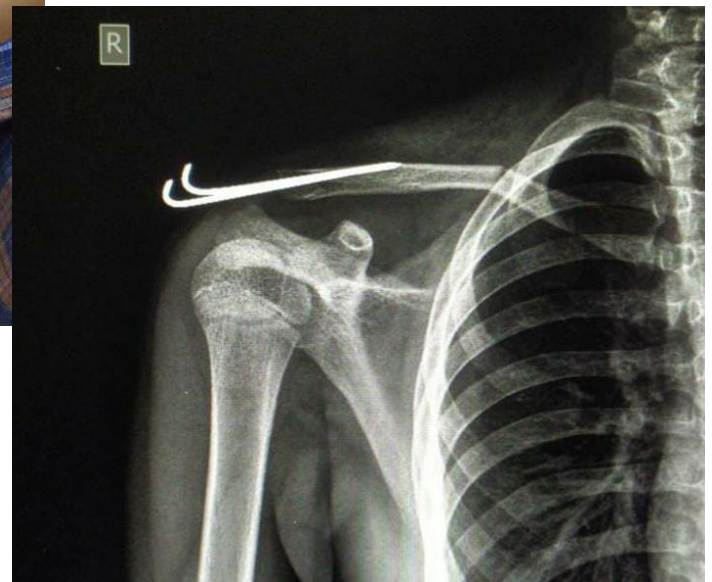
Figure 3: Post-operative radiographs showing well reduced right clavicle fractures with k wire fixation of the lateral end.

The treatment plan was explained to the parents of the patient, and their informed consent was taken. The plan was a surgical fixation of lateral physeal injury given gross displacement and conservative management of midshaft fracture because of minimal displacement. She was treated surgically by open reduction and k wire fixation of lateral physeal fracture under general anaesthesia (Figure 3, Figure 4). The torn periosteal sleeve was repaired around the lateral end of the clavicle. She was given arm pouch immobilization for four weeks, followed by shoulder and elbow joints' active mobilization.