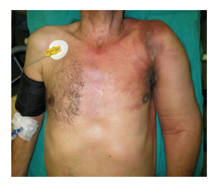
Figure 1: Severe edema in the left upper extremity of the patient.