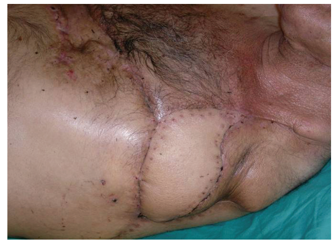
Figure 4: The patient three months after the final reconstruction with the latissimus dorsi free flap.

Tricholemmal cyst walls resemble hair follicles in the catagen phase. When the anagen phase ends, a high percentage of the outer hair sheath undergoes apoptotic reduction and the follicle again goes into the catagen phase. When this is genetically mediated in an abnormal way, tricholemmal cysts occur (6). These cysts are mostly detected on the scalp, but are also found on the trunk, face and extremities, less often (2,7). The biological behavior of a cutaneous cyst undergoing malign transformation is important as it destroys tissues locally or by metastasis (1). Tricholemmal and other epithelial cysts may be the most common benign lesions, but their malign degeneration is extremely rare. Infiltrating margins, marked cellular and nuclear pleomorphism, abnormal mitotic figures and aneuploidy are the affirmative histological criteria for malignancy (1,7-9). The malignant transformation ratio was ascertained as 2-3%, including other clear cell tumors or