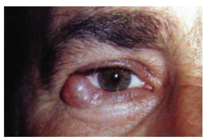
Fig. 1: Painless, firm, cystic mass at the lateral margin of the right lower eyelid.

to 76 years. While six of their lesions recurred following excision, there was only one case of metastasis, and seven cases of favorable prognosis. Wright and Font 4 reported the first series of mucinous adenocarcinoma of the eyelid with 40% recurrence in 21 cases. One death due to local extension was also described in this report. Bilateral primary mucinous carcinoma of the eyelid was reported by Bertagnolli et al. Two other cases of primary mucinous adenocarcinoma of the upper eyelid 5,6 and one of the lower eyelid 7 were reported with no recurrence during the follow-up. Another two cases of primary adenocarcinoma of the eyelid were reported with deep extension that needed exenteration 8 or en bloc removal of the aggressively invading tumor including the orbit, ethmoid and sphenoid sinuses.9 Recurrence of insufficiently resected primary mucinous adenocarcinoma was also reported.