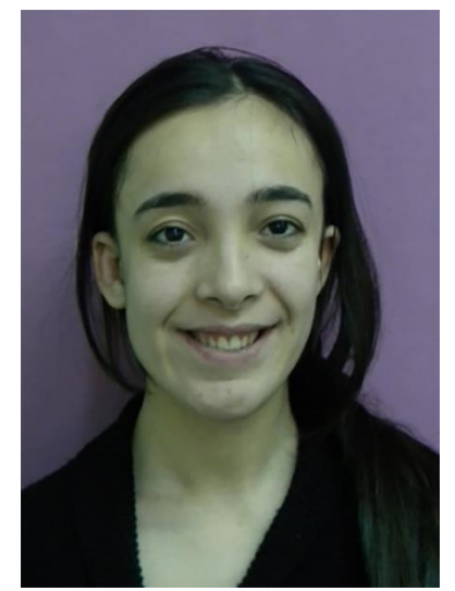
Figure 2B Postoperative result of case

The postoperative lateral cephalometric radiographs showed that mandible moved forward and the facial height didn't change after DO. Following the maxillary surgery, Class 1 relationship was kept. The results after four years follow-up were stable (Table 1). In the follow-up posteroanterior cephalometric analysis, mentum was overcorrected and this over correction was kept following four years. Gonial levels were equal. Occlusal and lip cantings were corrected. It was not obtained equalization in right and left nasal base levels but was better following distraction and rhinoplasty operation (Table 2). The occlusal canting was more balanced and gummy smile on the right was corrected (Figure 2B). Maxillary and occlusal canting was corrected without facial elongation and she had better smile. Although equalization in underlying skeletal structures in vertical plane was obtained, the gonial region was still has less volume so fat grapting was added to overcome the hypoplastic soft tissue and left side appeared more fully appearance. Left gonial level seems decreased after Le Fort 1 surgery but didn't change in follow-up period (5 years).