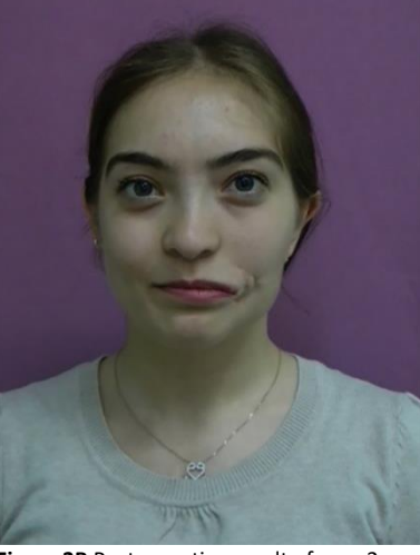
Figure 3B Postoperative result of case 2.

In the follow-up posteroanterior cephalometric analysis, mentum was overcorrected four milimeters to the right and this over correction decreased following 5 years. Maxillary and mandibular midline coordinated midfacial reference. Gonial levels were equal. Occlusal cantings were corrected but lip canting continued due to the previous scar tissue. It was obtained equalization in right and left nasal base levels following DO. Although equalization in underlying skeletal structures in vertical plane was obtained, the gonial region and left cheek had still less volume so an additional fat grafting was added (15 cc) to overcome the hypoplastic soft tissue and left side appeared more fully appearance (Figure 3B).