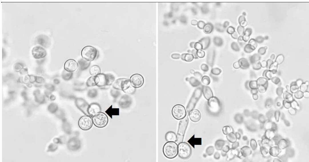
Figure 2 : Microscopic appearance of C. dubliniensis after 24-48 h of culture on cornmeal agar (x400 magnification). The black arrows point to thick-walled triplet terminal chlamydospores.