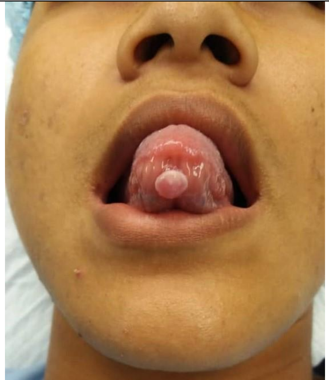
Figure 1. Exophytic mass at the ventral surface of tongue, smooth surface and well circumscribed.

Upon examination noted exophytic mass at the ventral surface of tongue, measuring 1cmx1cm, smooth surface, well circumscribed and pedunculated base (Figure 1). There were no bleeding and discharge from the mass as well as it was non tender on palpation. Oral hygiene was good and no sharp tooth seen. Other ear, nose and throat examinations were unremarkable. In view of the benign looking lesion, patient was subjected for excision under local anaesthesia. The mass was successful excised using Colorado diathermy. Patient was review again in clinic one week after excision, noted raw area with minimal slough formation (Figure 2). Histopathology examination of the mass was confirmed pyogenic granuloma.