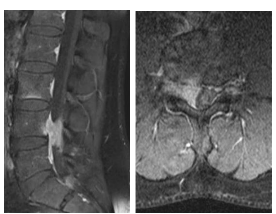
Figure 1. The first lesion; MRI revealed tumors mass right spinal root.

The patient was operated with L4-5and L5-S1 hemilaminectomies and three tumor tissues were removed gross total from epidural spinal region. Immediately following surgery, his right leg pain resolved, and motor deficit improved. Histopathological examination was reported as metastatic renal cell carcinoma and the patient was referred to oncology department for further evaluation and treatment.