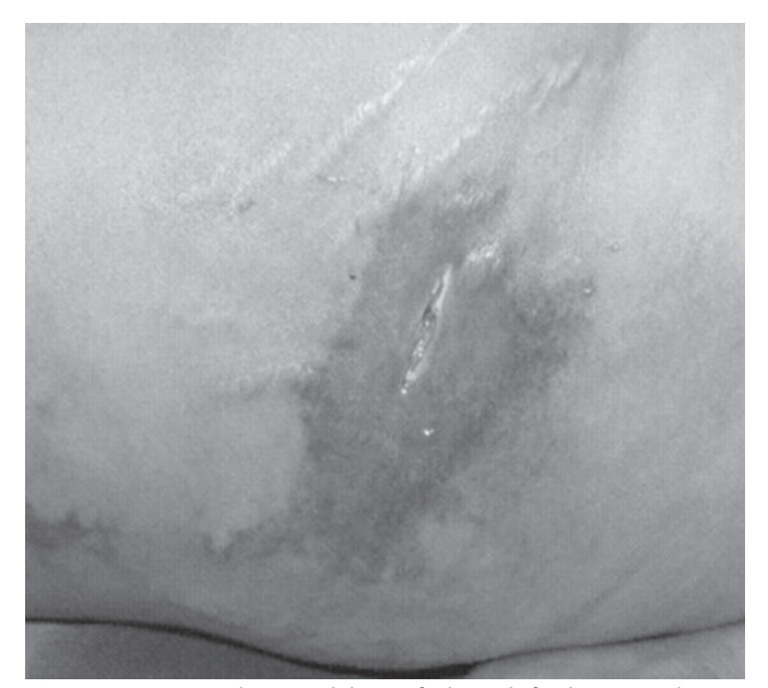
Figure 5: Retrograde necrotizing soft tissue infection secondary to bowel perforation as a complication of monopolar laparoscopic electrosurgery.