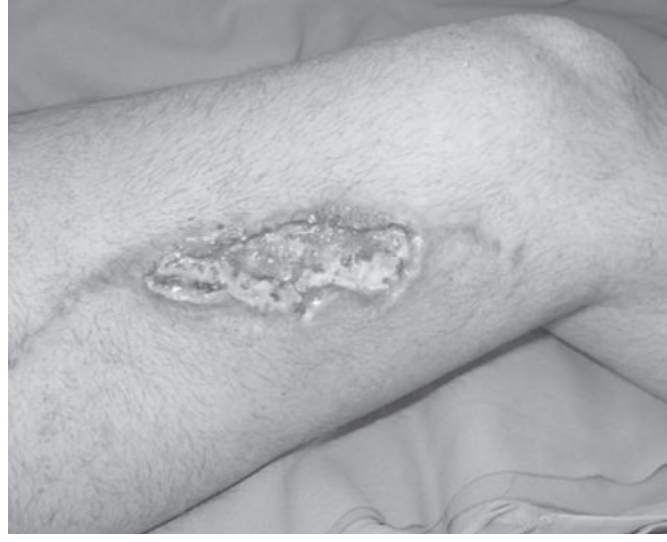
Figure 6: A wound on the thigh caused by a partially detached grounding pad.

may be a combination of two or more factors rather than just one (36). The sacral region is a common site of electrosurgeryinduced burns, and physiological as well as electro-mechanical factors are generally involved (28). Circulation in the sacral region is poor compared with that in other areas of the body, especially owing to contact pressure when the patient is lying in the supine position. In electrosurgery, impaired circulation means a reduction in the discharge of heat generated in tissue by the current flow (28). It cannot be established whether these accidents were due to excessive moistening of the operating sites, to blood and rinsing fluid that seeped under the patients or to urine from a leaking catheter. Blankets that are frequently used in cardiovascular operations could also facilitate these injuries and patients must be kept a suitable distance from the heater and the length of time that heating blankets are used for must be shortened (37).