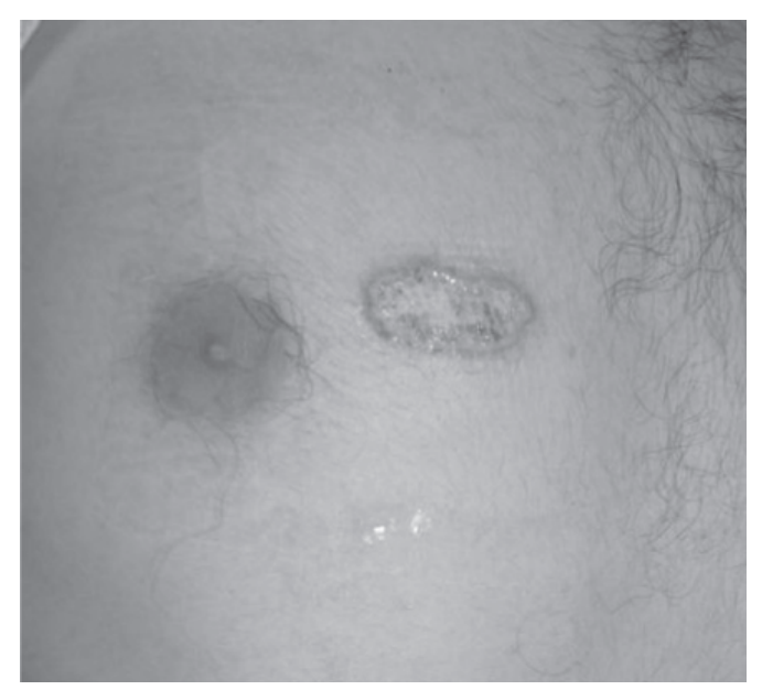
Figure 1: Second-degree alternative site burn on the chest of the patient.

Case 2: A 42-year-old, quite tall, male patient was diagnosed with third degree burns to both heels (Fig. 2) following long (seven hours) multi-department surgery after a traffic accident. Hemostasis was exclusively achieved by monopo-