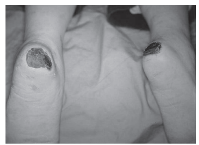
Figure 2: Third-degree burns on the heels of the patient.

lar "coag" current during the operation. This injury was also partially attributed to an alternative site burn, considering the height of the patient and the length of the procedure. The patient's heels presumably extended beyond the insulating rubber covering the operating table and were touching the metallic part throughout the surgery, resulting in a deep burn. The ischemia caused by the continuous pressure almost certainly alleviated the injury, but we could not consider these pressure sores as the injury was detected the day after surgery. The period of 24 hours was thought to be too short to result in such a deep injury. Wetness of the surgical dressing and electrodes must be avoided and possible problems in the monitor or any conductive, grounded equipment that is in contact with the patient must be suspected, taken seriously and checked out routinely to prevent such accidents in cases one and two.