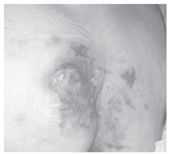
Figure 3: Second-degree wound on the buttock.

Case 4: A deep third-degree lesion covering the entire sacro-gluteal region of a 69-year-old male patient (Fig. 4) was noticed three days after long-lasting cardiovascular by-pass surgery, in which monopolar electrosurgery had been exclusively utilized. Although adequate debridement and several daily dressing changes were performed, the patient died from systemic septicemia three weeks after the surgery. These kinds of injuries are occasionally encountered after long-lasting cardiovascular procedures and monopolar electrosurgery; the high voltage "coag" mode is usually the scapegoat. The skin injuries are not necessarily located under the grounding pad or near the monitoring electrodes and the causes of these wounds