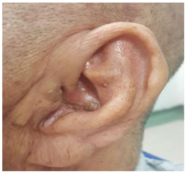
Figure 2: Resolved ear infection