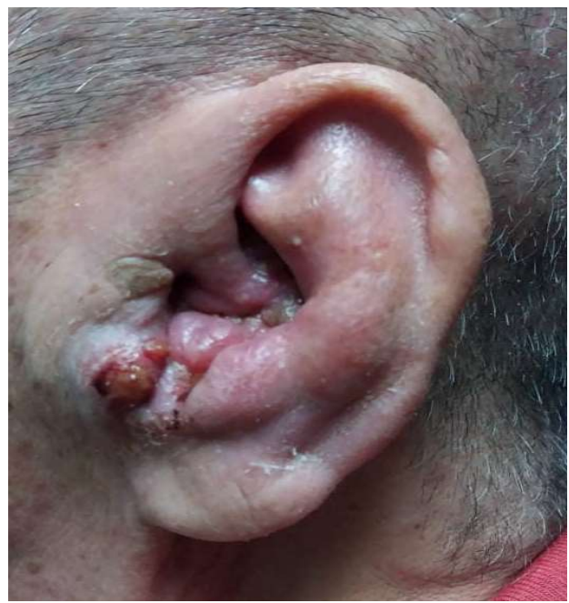
Figure 1: Swollen and inflamed left pinna

Upon examination, patient was comfortable, not septic looking and afebrile. Left pinna was swollen, tender, inflamed with excoriation and pus discharge seen from the external auditory meatus (Figure 1). Pinna was however not pushed medially. There was no mastoid swelling or tenderness. Otoscopic examination was not possible as the ear canal was filled with pus. Facial nerve examination was normal. Right pinna and ear canal examination was normal with an intact tympanic membrane. Oropharynx examination was unremarkable and neck nodes were not palpable. Nasoendoscopy examination was normal. All other cranial nerves were intact and no other neurological deficit was evident. Systemic examination was normal. Tuning fork test revealed left conductive hearing loss. Full blood count and electrolytes were within normal range.