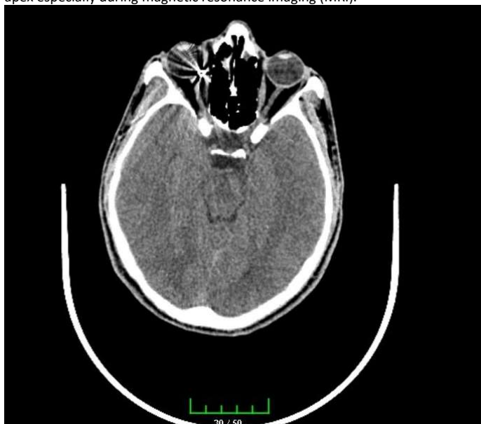
Figure 3: Computerized tomography showing a retrobulbar foreign body in the right orbit.

The patient's past history was negative for any medical or surgical diseases. When asked about trauma, his parents recalled that the patient applied to the emergency service with conjunctival hemorrhage complaint nearly 15 years ago. Topical antibiotic therapy was started with 2 weeks duration and conjunctival hemorrhage recovered after this treatment. Based on the history and ophthalmological examination findings, a diagnosis of chorioretinitis sclopetaria was suspected and posteroanterior and right lateral radiographs of the orbit were performed to confirm the diagnosis. X-rays revealed an intraorbital foreign body in the right orbit, and this was confirmed on computerized tomography (Figure 3). It was thought that he had been accidentally shot with a BB gun, when the computed tomography (CT) images were analyzed. No surgical intervention was undertaken. The patient was warned about the potential risks of the metal foreign body adjacent to the optic nerve in the orbital apex especially during magnetic resonance imaging (MRI).