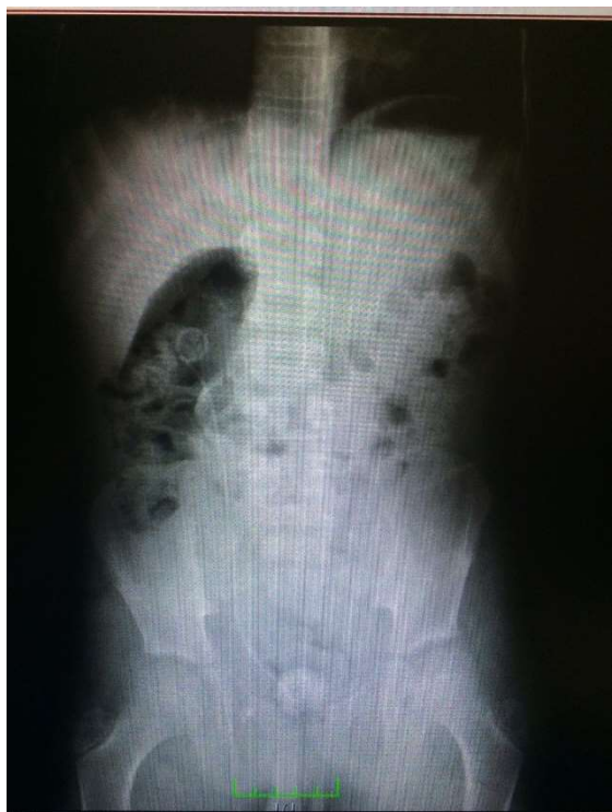
Figure 1. X-ray: A whole encrusted right double j stent in bladder.