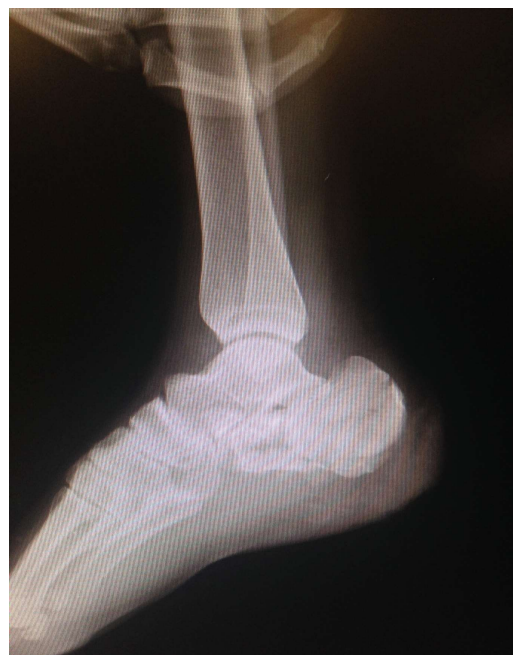
Figure 1A. A 32 year-old male patient with calcaneus fracture due to fall from height. His preoperative lateral radiographic view.

The patients were operated on after a mean duration of 5.4 days (range, 1-14 days) following their admission date. The mean follow-up was 34.4±20.1 months. At the last follow-up, the mean Böhler's angle was 20.8±10.2 degrees.