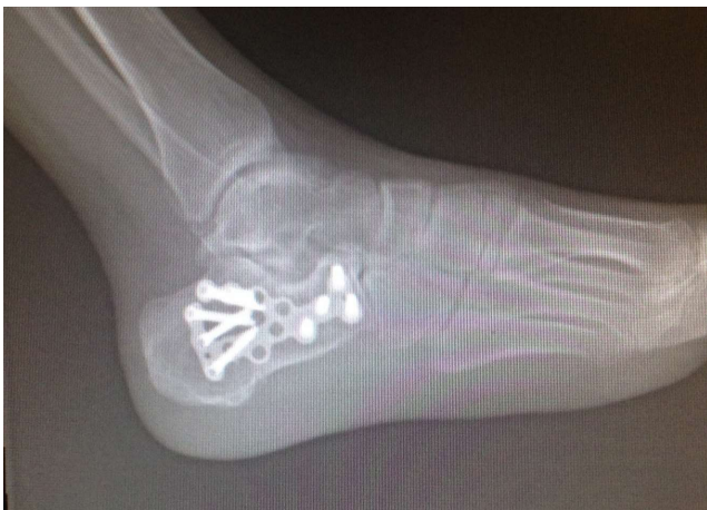
Figure 1C. Lateral radiographic view at the postoperative 23rd month.

The correlation analysis revealed that AOFAS score was found to be significantly and positively correlated with the preoperative Böhler's angle and significantly and negatively correlated with the Sanders classification type