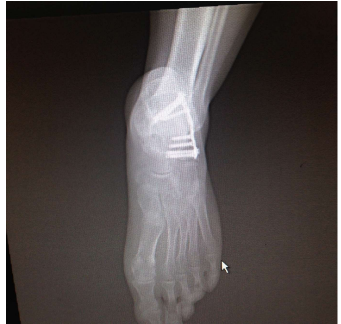
Figure 1D. Anteroposterior radiographic view at the postoperative 23rd month.

Since wound site complications are common on the skin of the respective region in the calcaneal fractures, there are debates on the use of extended lateral approach for the treatment of these fractures in recent years.