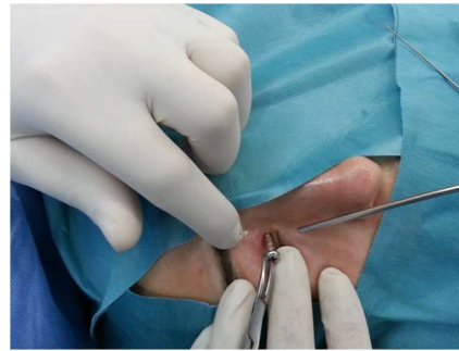
Figure 4: Foreign body removed from medial canthus

Periosteal dissection was performed around the foreign body and the head of the screw was exposed. No fracture was observed when the bone structures were examined. A simultaneous nasal examination was performed in order to check intranasal extension and bleeding, and the 1.5 cm long screw was removed in a controlled manner using a screwdriver and clamp (Figure 4,5). The incision was closed after bleeding had been controlled. No functional problems or wound-healing complications developed during the postoperative period and the patient had no complaints at the follow-up visit performed 6-months later.