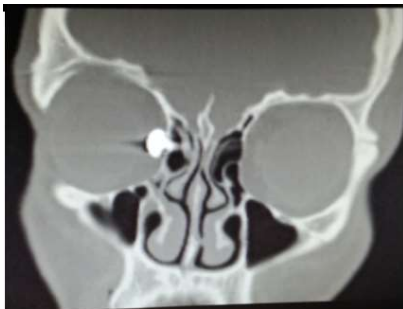
Figure 2: Computed tomography image of foreign body

Three dimensional computed tomography showed a metal screw that ran along the medial wall of the orbita to the inside of the right ethmoid sinus (Figure 2,3).