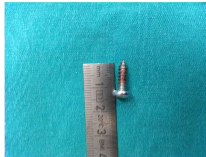
Figure 5: 15 mm screw