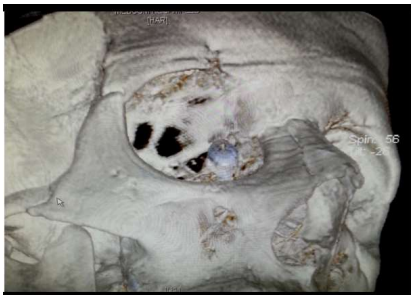
Figure 3: 3D image shows that screw at the lateral wall of ethmoid sinus

The patient was operated under general anesthesia. An incision was performed on the laceration at the medial canthal region and bone structures of the medial wall were accessed while preserving the lacrimal sac and medial canthal ligaments.