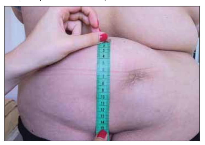
Figure 1. Lumbosacral giant lipoma

This process continues in the craniocaudal direction between 22-23 days to 25-27 days of embryologic life . The openings that are formed at the cranial and caudal regions are termed the cranial and caudal neuropores. The cranial neuropore closes approximately on day 24 and the caudal neuropore on day 26. Failure of the caudal (posterior) neuropore closure results in spina bifida.