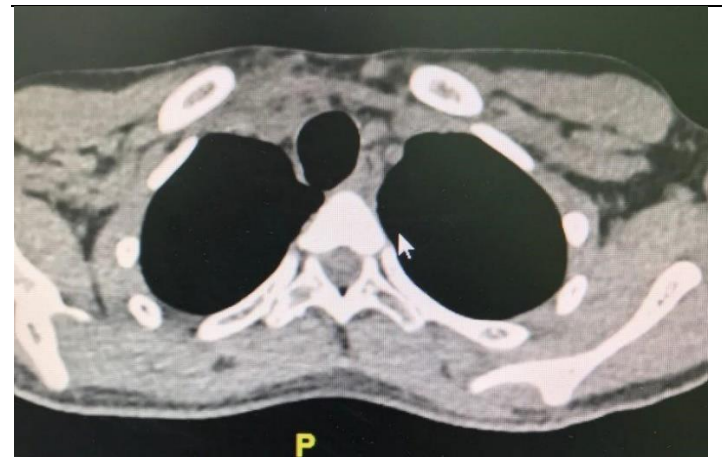
Figure 3: CT Neck revealed reduction of size of posterior tracheal laceration