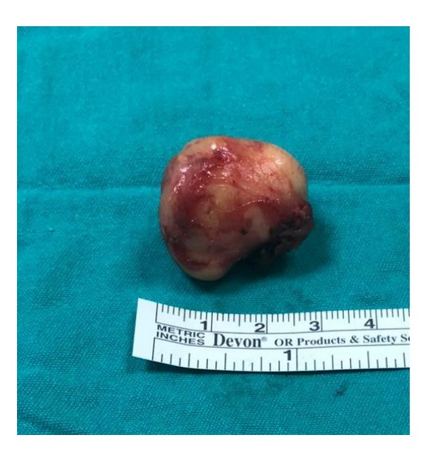
Figure 2: Mass totally excised with endoscopic trans nasal approach