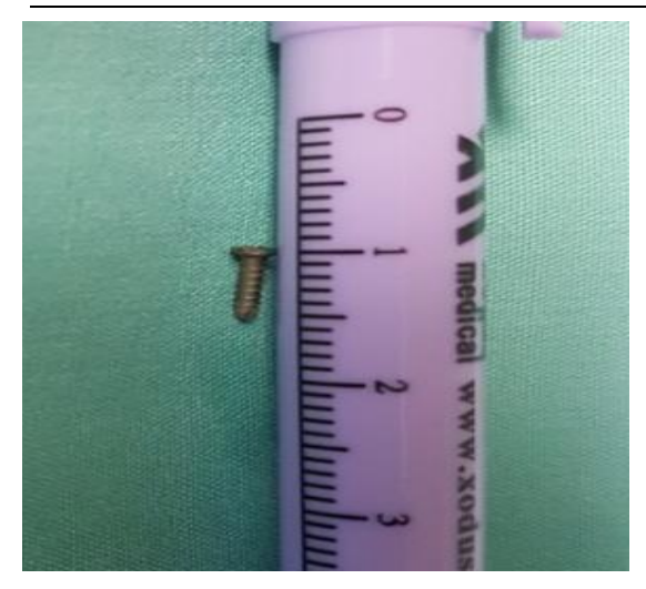
Figure 3. Screw measured about 5mm length.