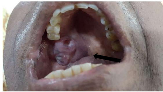
Figure 1: Ulcerative mass occupying right-side of hard palate, alveolus and buccal

Upon review, patient was comfortable. Intraoral examination revealed an ulcerative growth measuring 3 cm x 2 cm over the right posterior half of hard palate, alveolus extending to the gingivobuccal sulcus firm in consistency, nontender, non-friable and bleeding upon touch (Figure 1). There was also no medialization of the posterior pharyngeal mass, tonsils were not enlarged and the overlying mucosa was intact. No palpable neck nodes were noted.