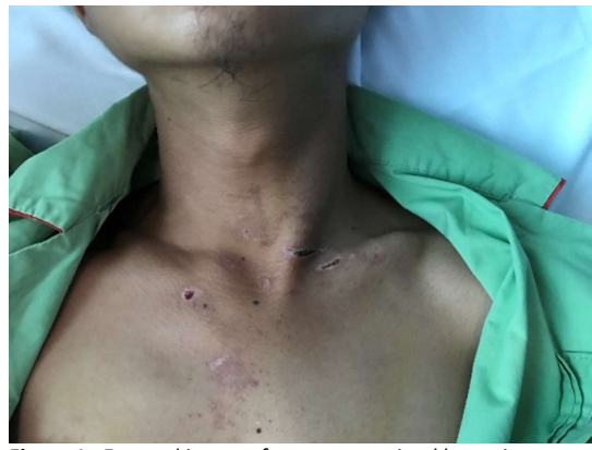
Figure 1: External image of trauma sustained by patient

However, there was no mucosal oedema and the other structures were normal. Intravenous (IV) dexamethasone was started along with mecobalamin.