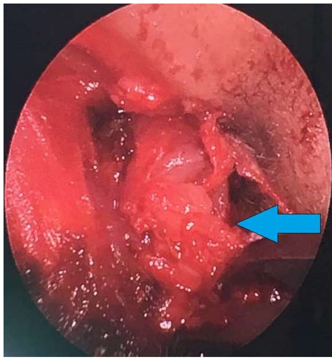
Figure 2: Mass (arrow), during the excision biopsy procedure