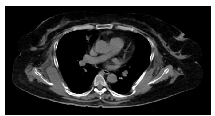
Figure 2: A chest computed tomography reveals multiple rib fractures accompanied by hematoma that presses fractured ribs into the bilateral lungs.