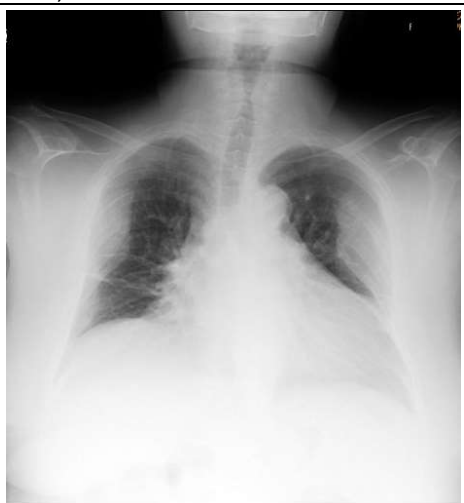
Figure 1: A chest roentgenogram reveals bilateral rib fractures and hump-like shadows.