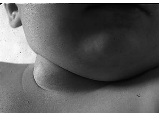
Figure 1: Second branchial cyst in an infant( Courtesy of Prof.Dr.A.Can Başaklar Gazi University Medical Faculy, Ankara, Turkey).

Usually sinuses and fistulas are encountered in younger ages, while cysts are observed in adolescent or adults (Figure 1). Ford et al. showed in 98 cases that the majority (78%) of second branchial anomalies are seen by the age of 5. Most of them manifested themselves by an intermittent mucous or purulent discharge during the newborn period (4). In Agoton Bonilla's 148 cases in adults, 80.8% of the patients had cysts and the rest had fistula (11). The symptoms of our cases were discharge (79%), cervical mass (7%), and the presence of an external orifice (14%)(Figure 2). Eight of our cases had had discharge since newborn period. Sometimes a skin tag or a cartilaginous remnant can be noticed around the external orifice(1.3).