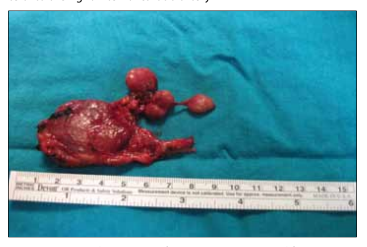
Figure 2. Surgical specimen of a 30x 40 mm mass and four reactive lymph nodes dissected from the right inferior cervical region

aspiration was performed under USG guidance. Examination of fine needle aspiration by cytology reported haemorrhagic lymphoid tissue. Subsequent computed tomography imaging detected a 4.5x4x4 cm, lobular, well-circumscribed mass in the right parotid region which extended to the deep lobe of the gland (Figure 3).