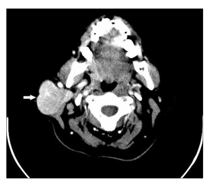
Figure 3. Computed tomography. A lobular, well-circumscribed mass was found in the right parotid region, extending to the deep lobe of the gland